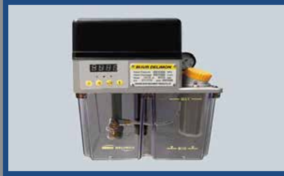
Automatic Fuel Supply System

Germany BECKER oil-free blowing and suction dual-purpose vacuum pump.