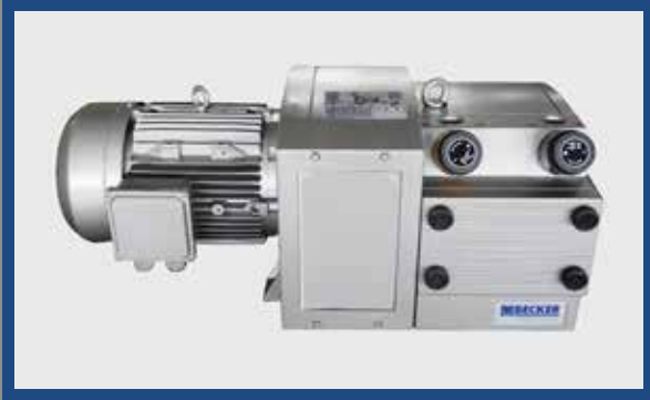
German Vacuum Pump

Germany BECKER oil-free blowing and suction dual-purpose vacuum pump.